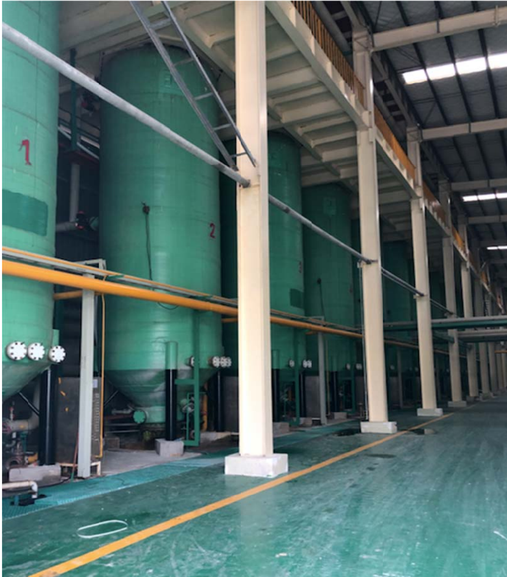
Figure 2. 'Chemical pickling' vats used in Silica sand product beneficiation, Fengsha Group, China