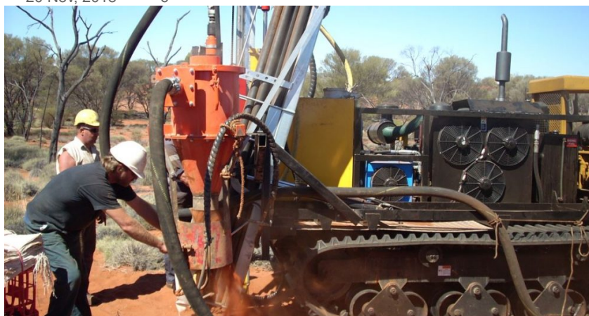
Image of Diatreme drilling mineral sands at Eucla Basin

Emerging mineral sands miner, Diatreme Resources Limited (Diatreme), has just announced positive results following a Definitive Feasibility Study (DFS) on their flagship Cyclone Zircon Project (Cyclone) in Western Australia's world-class Eucla Basin, putting the project on track for development.