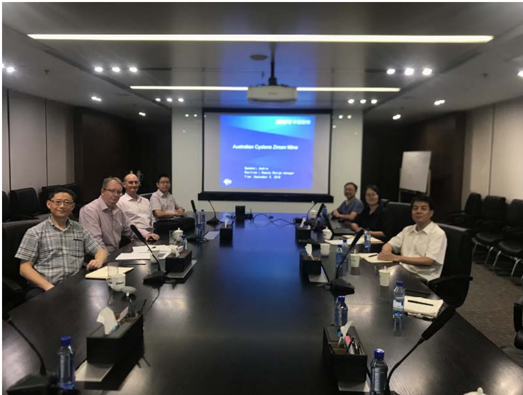
Diatreme talks with ENFI held in China, September 2018